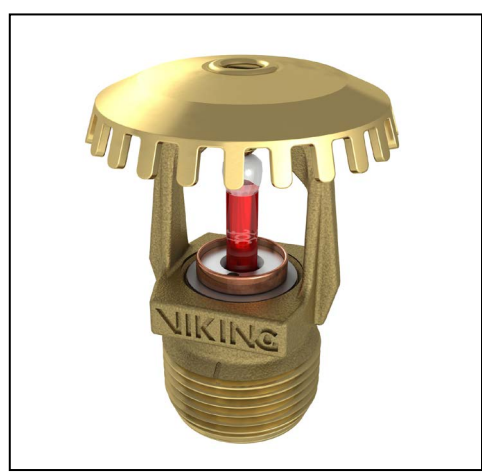
NOTE: As of May 2018 all logos have been removed from the wrench hoss

Viking standard response sprinklers may be ordered and/or used as open sprinklers (glass bulb and pip cap assembly removed) on deluge systems. Refer to Ordering Instructions below.